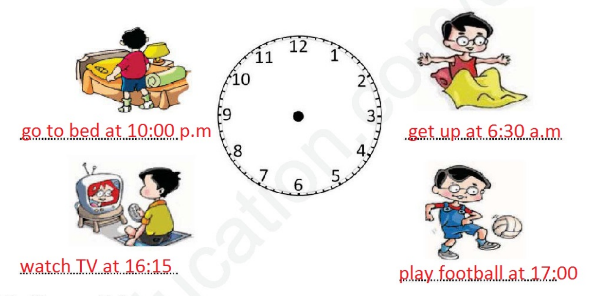
Task 1: Read the text name the activity and write the correct time.

Hello .My name is Samir .I am a pupil. I get up at half past six. I have breakfast at 7:00 . I go to school at 7:30 . I have lessons from 8:00 to 15:30 . I have lunch at school . When I return home, I watch TV at quarter past four then I play football at five o'clock . I have a shower at seven o'clock then I do my home works at 19:30 .I have dinner at half past eight . I go to bed at ten o'clock.