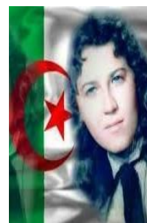
Glory to our martyrs